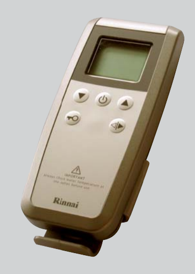
Wireless Controller - MC503RC