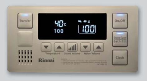
Deluxe Bathroom Controller - BC100V